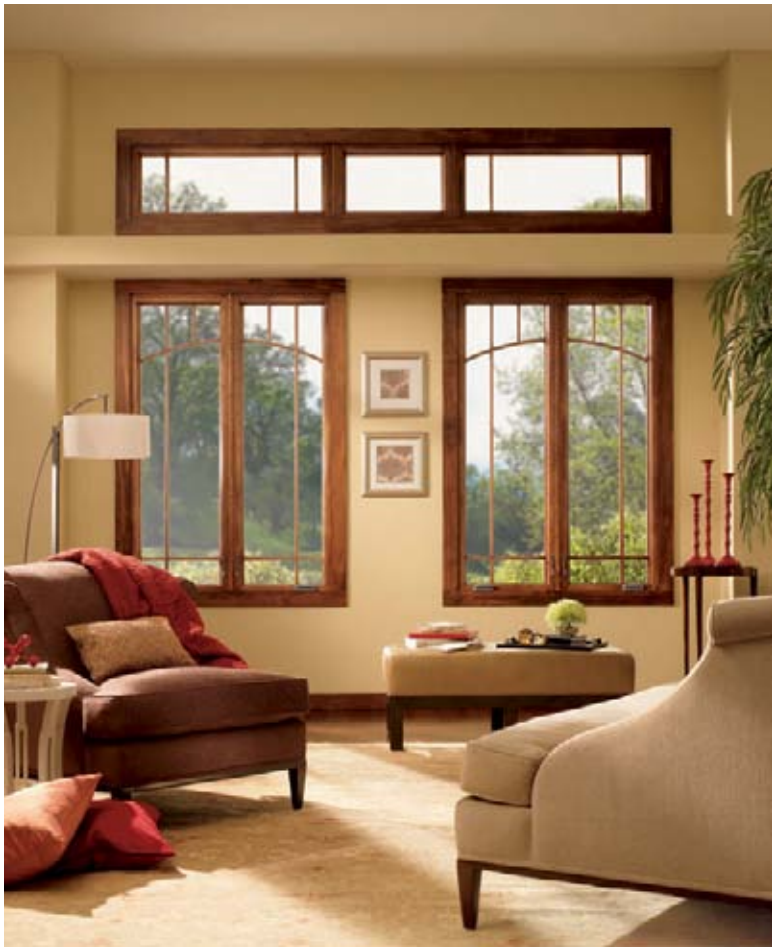
©2010 Marvin Windows and Doors. All rights reserved. ®Registered trademark of Marvin Windows and Doors.

To build this collection, we went to the best suggestion box of all.