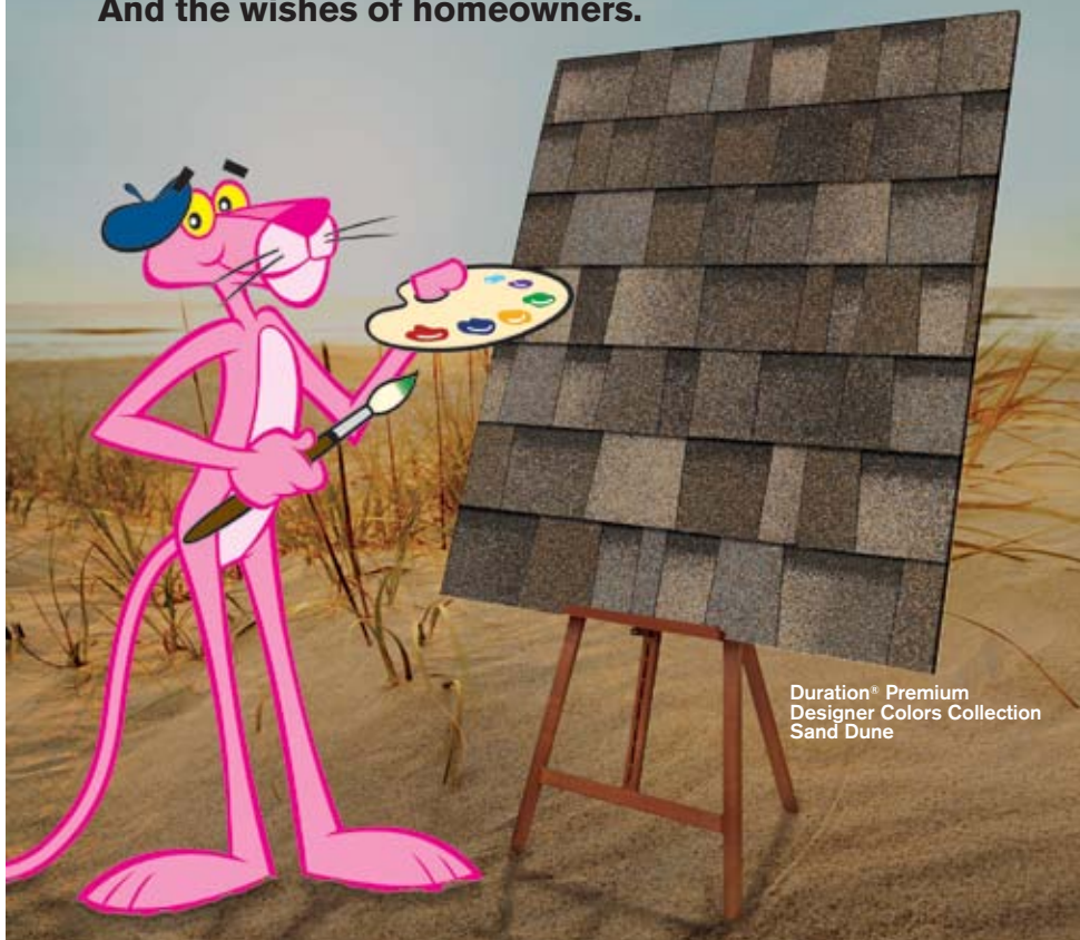
Duration® Premium Designer Colors Collection Sand Dune

Inspired by the colors of nature. And the wishes of homeowners.